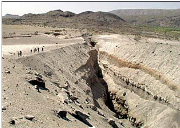
The rift that opened up in 2006 at Dabbahu, northern Ethiopia.

Numbers tells the story of how certain men rebelled against Moses and Aaron. In the ensuing confrontation the ground under the rebels split apart and they 'went down live into Sheol' (Nu 16:33). Sheol was a region of darkness under the earth.