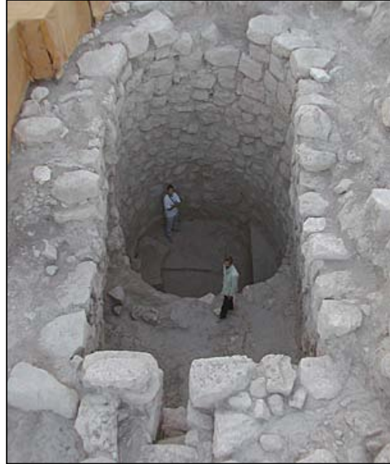
The passage to the underworld excavated at Tel Mozan, Syria. The bones of dozens of sacrificed animals were found in the pit. Texts show that they were used to purify the supplicant (often the king) before he summoned up the spirits from below.

The abyss is the dwelling place of demons, visualised as connected to the world of the living by a vertical shaft (Rev 9:1). Demons are depicted in the art of many ancient peoples, from Mesopotamia to South America. Their appearance is part human, part animal: the ‘scorpion men’ of Babylonia, for instance, had a human head, the talons and hindquarters of a bird and a scorpion tail. In the Bible they are unfettered spirits who originally inhabited the antediluvian world and have come up from the abyss. Having formerly had bodies, they seek to take over the minds and bodies of the living; possession of even a pig’s body is preferable to returning to the abyss (Lu 8:31). In the future they will suffer torment, as they are aware (Matt 8:29). The abyss is not currently the dwelling place of Satan. He is the ‘ruler of this world’ (Jn 12:31), cast down from heaven only as far as the earth’s surface (Rev 12:9). He prowls about like a roaring lion, seeing whom he can devour (I Pet 5:8).