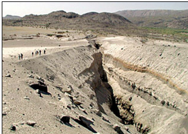
The rift that opened up in 2006 at Dabbahu, northern Ethiopia.

In the book of Numbers we read about how certain men rebelled against Moses and Aaron. In the ensuing confrontation the ground under the rebels split apart and they ‘went down live into Sheol’ (Nu 16:33). Sheol was a region of darkness under the earth.