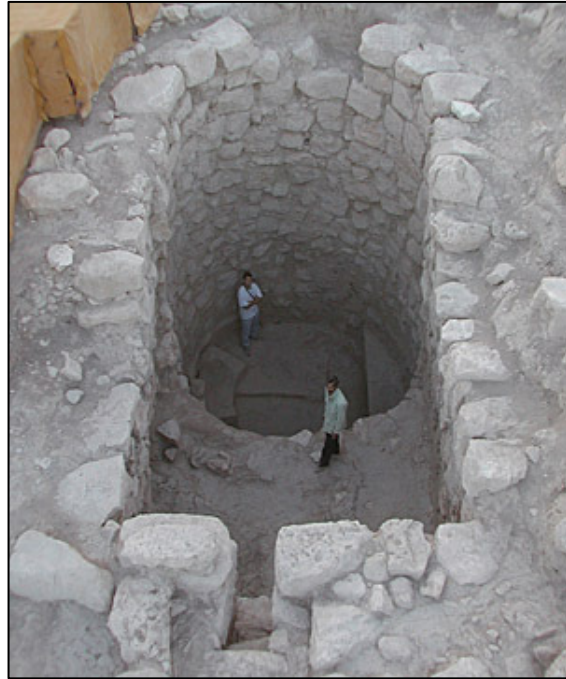
The passage to the underworld excavated at Tel Mozan, Syria. The bones of dozens of sacrificed animals were found in the pit. Texts show that they were used to purify the supplicant (often the king) before he summoned up the spirits from below.

Those who die in Christ are said to ‘sleep’ (I Cor 15:6, 18, Eph 5:14, I Thes 4:13), a metaphor for non-consciousness. Their state is the same as that of others who have died, but before God they have a different status: having accepted the Saviour, they have passed from death to life (Jn 5:24, 8:52). They are not resurrected individually and immediately but as one body on ‘the last day’. They will not go through a second death (discussed below) but will receive life in its fullness. The verb ‘die’ is never used.