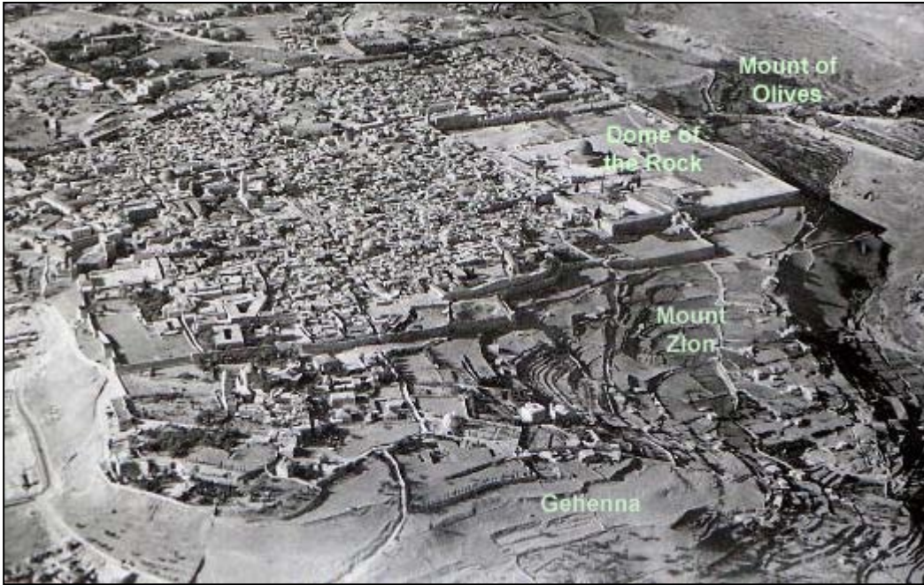
Aerial view of Jerusalem in the early 20 th century.